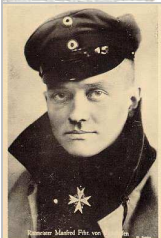
Baron von Richthofen "The Red Baron"